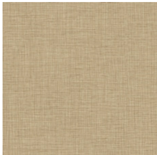
ANTIQUE LINEN F4016-538 Drop: 19.69" Repeat: 39.37"x 39.37"