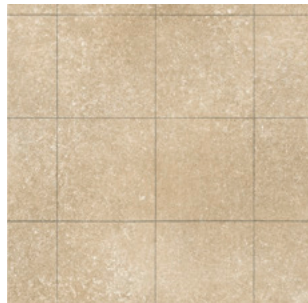
SANDY BEACH F4016-539 Drop: 19.69" Repeat: 39.37"x 39.37"