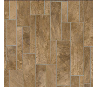
COBBLE CREEK F4016-546 Drop: 19.69" Repeat: 39.37"x 39.37"