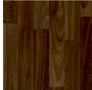
BROWN SATIN F4016-739 Drop: 19.69" Repeat: 39.37"x 39.37"