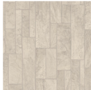
PEARL GREY F4016-502 Drop: 19.69" Repeat: 39.37"x 39.37"