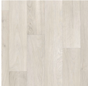
ANTIQUE PEARL F4016-757 Drop: 23.62" Repeat: 47.24"x 39.37"