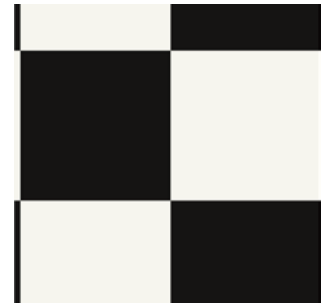
CHESS BOARD F4016-509 Drop: None Repeat: 39.37"x 39.37"